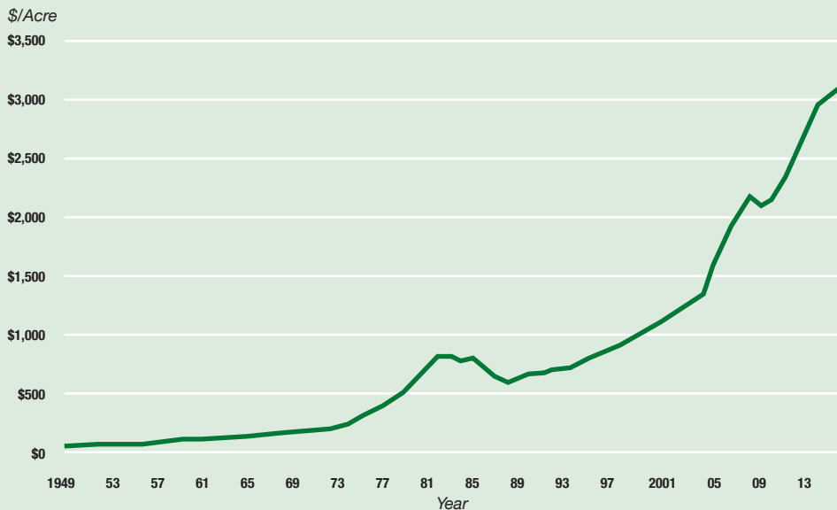
Figure 1: Average U.S. farm real estate values

– where there has been a robust land market – will see a larger decrease.